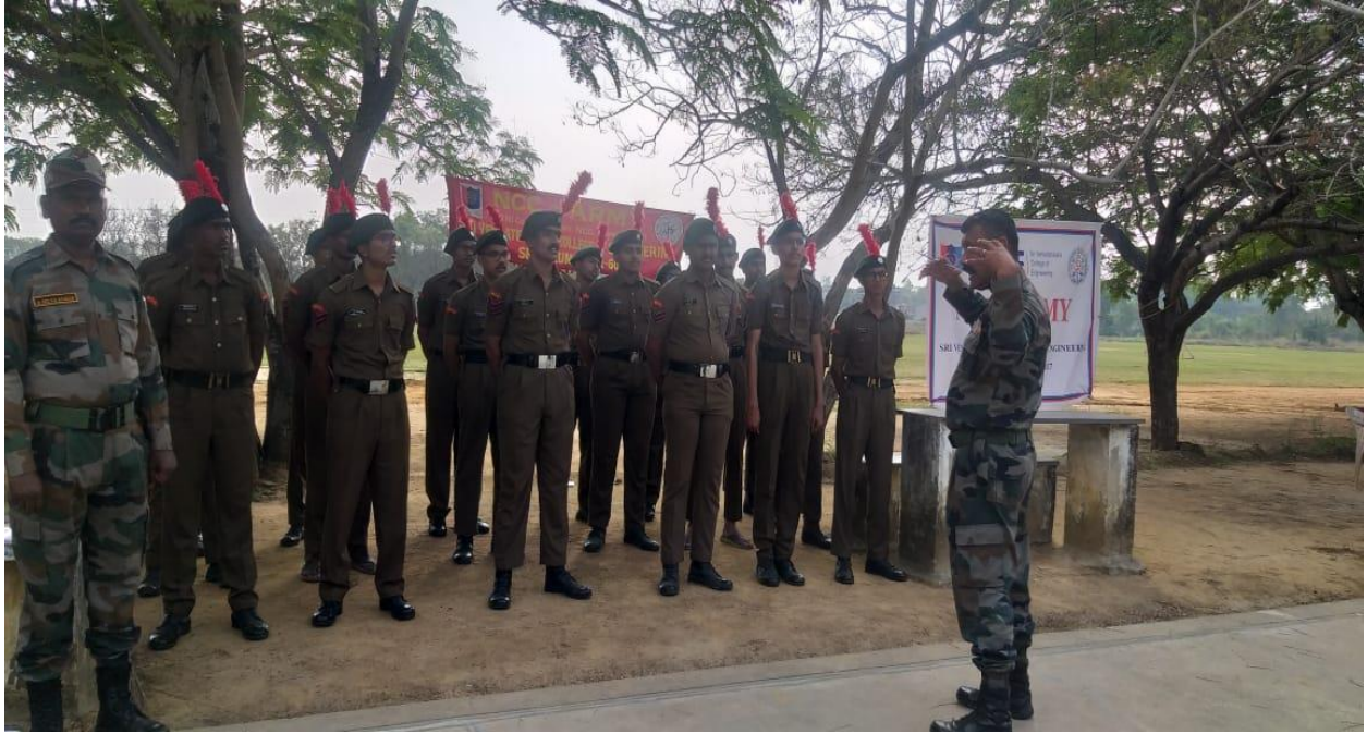
Figure 2. PI Staffs Teaching Types of Fire and its Extinguishing Methods