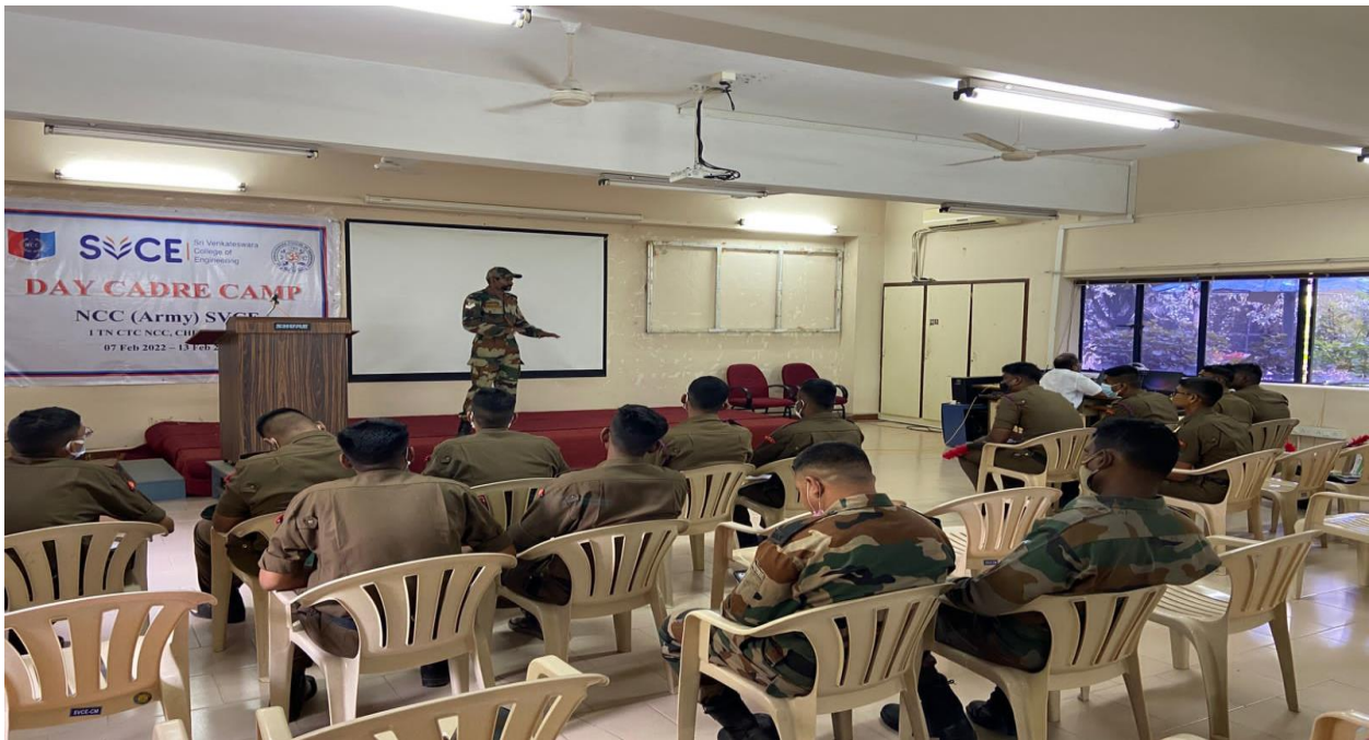
Figure 3. PI Staff discussing on the topic Field Craft and Battle Craft