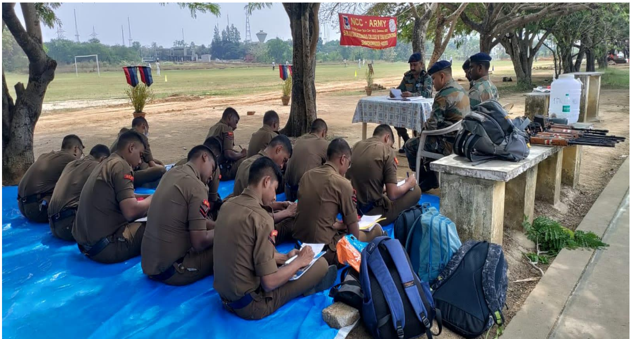
Figure 3. Cadets writing feedback letter