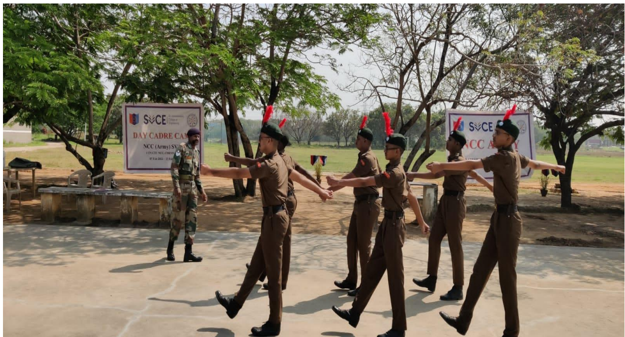
Figure 5. Cadets practicing Foot Drill