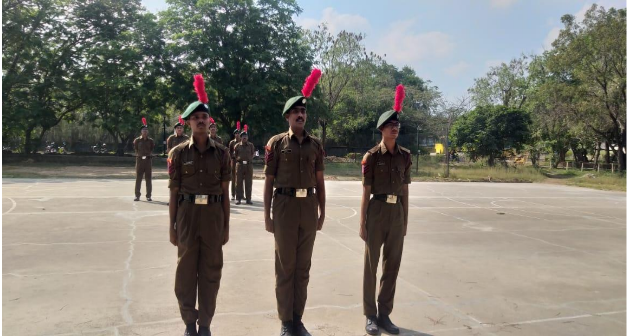
Figure 2. Cadets ready for kholna-jodna test