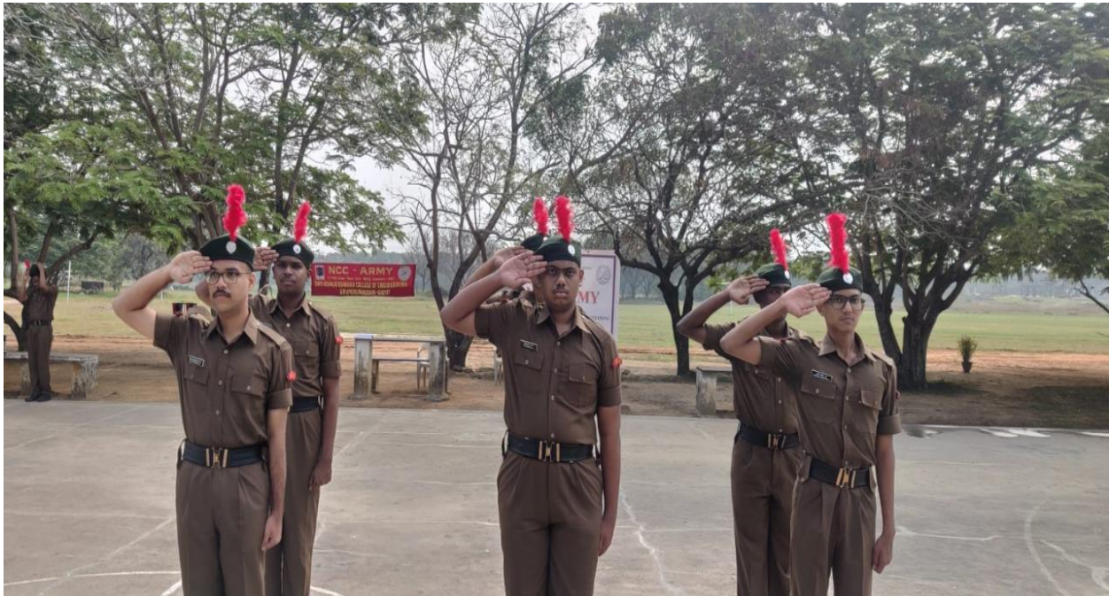
Figure 1. Cadets practising the parade