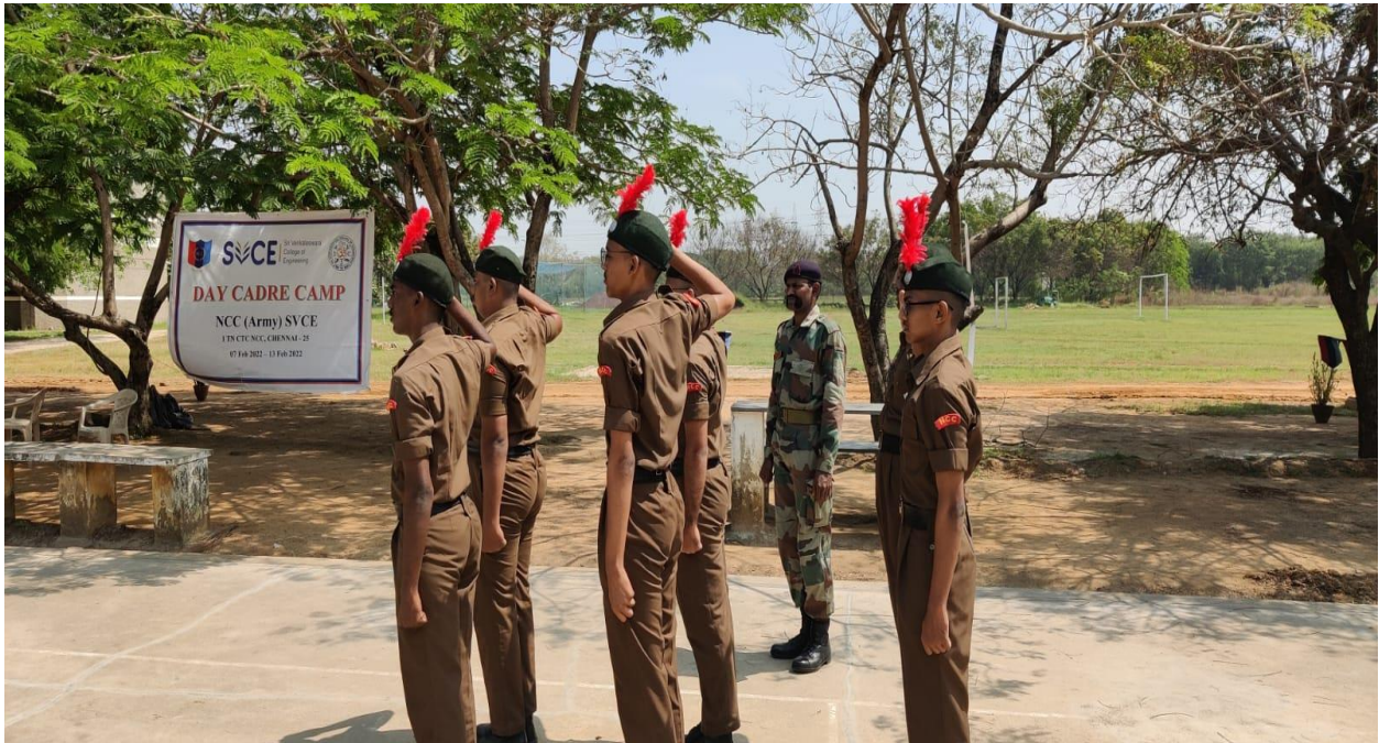
Figure 3. Cadets practising the drill