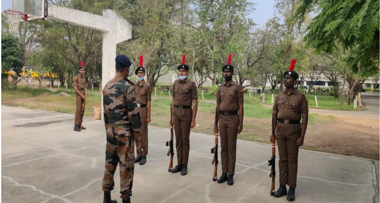
Figure 2. JCO giving instructions to the cadets