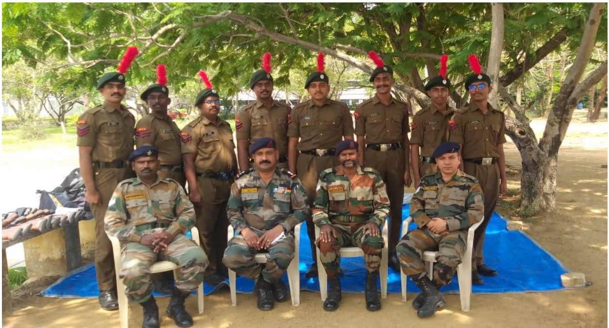
Figure 5. Photo Session