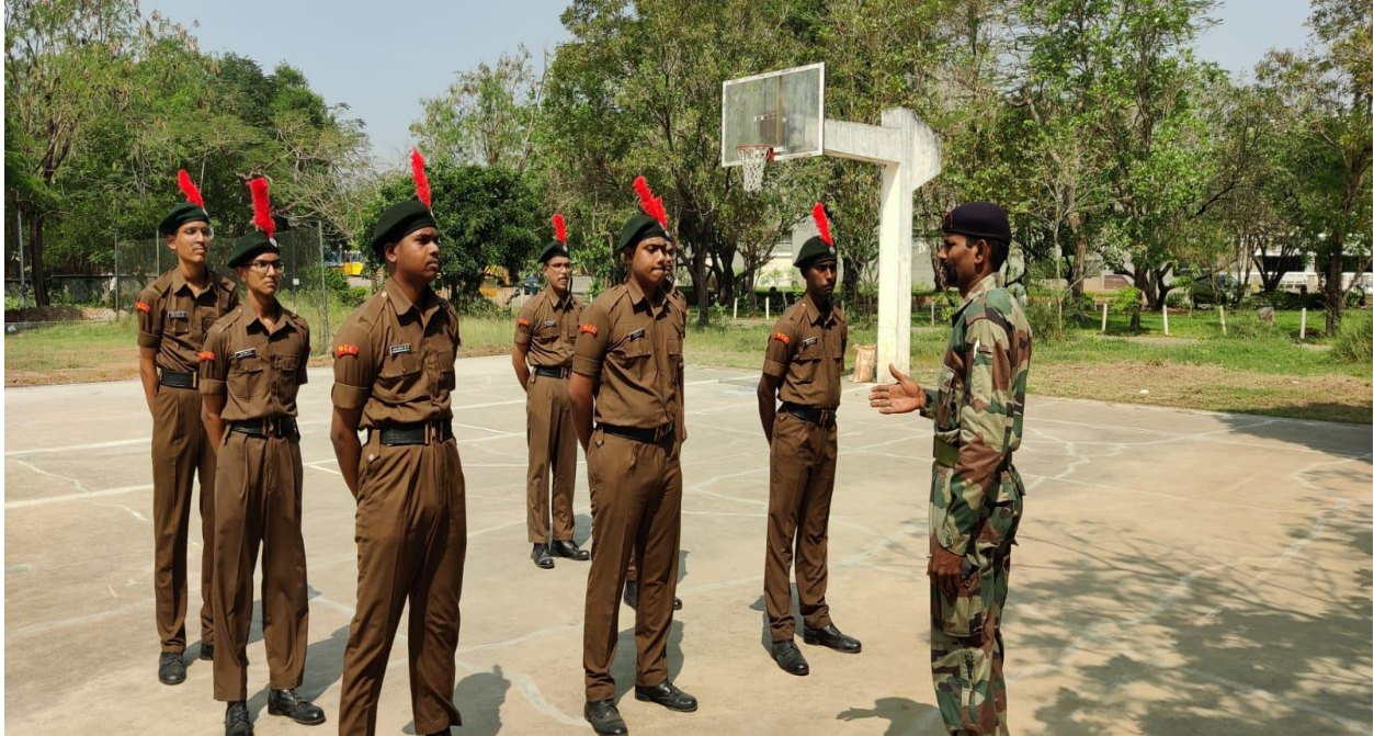
Figure 2. PI staff giving instructions to the cadets