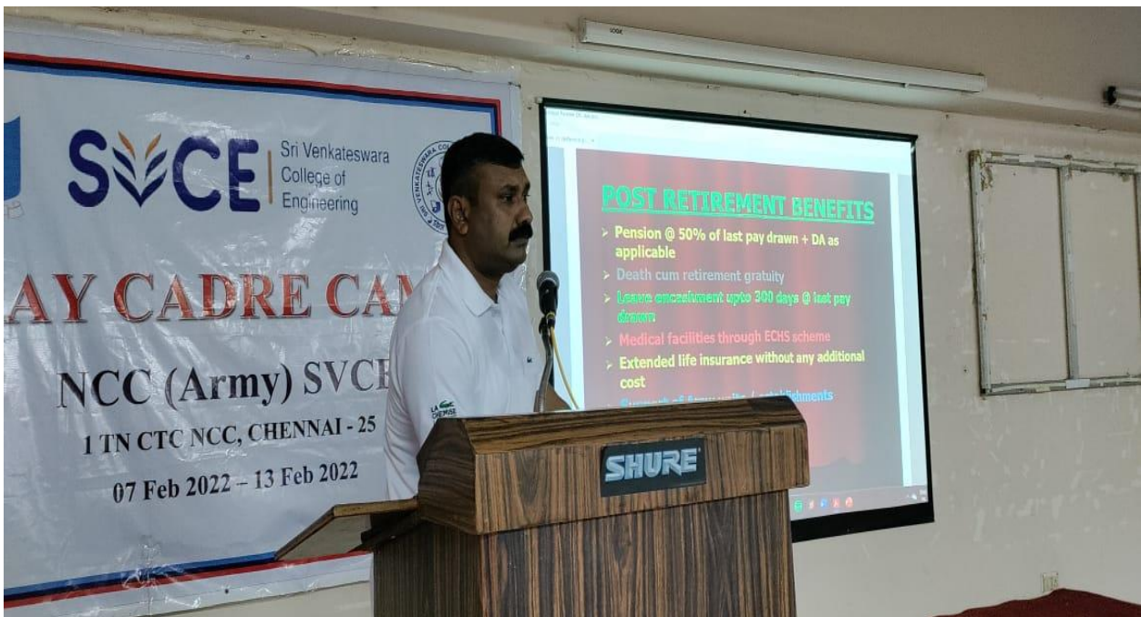
Figure 5. JCO discussing about the Careers in Defence Forces