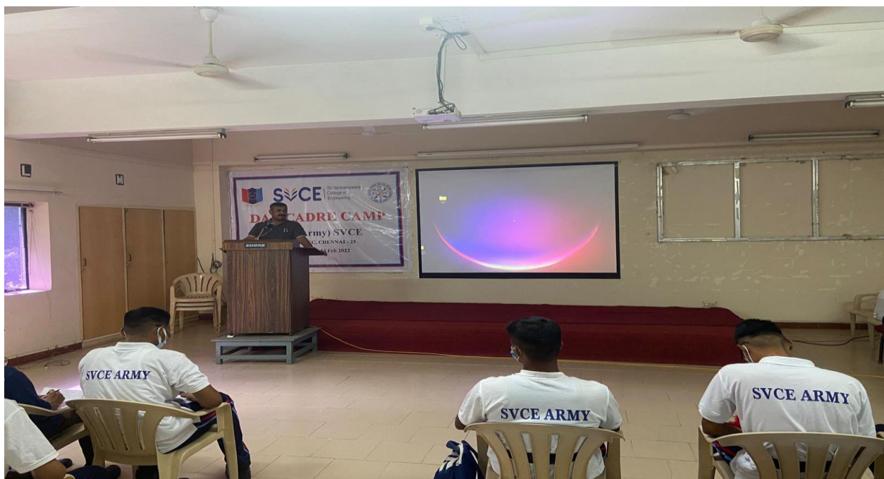
Figure 5. JCO discussing about the structure of Indian Army