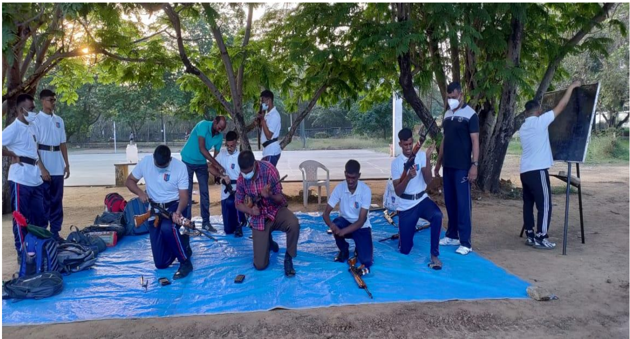
Figure 5. Cadets practiced Kholna-Jodna