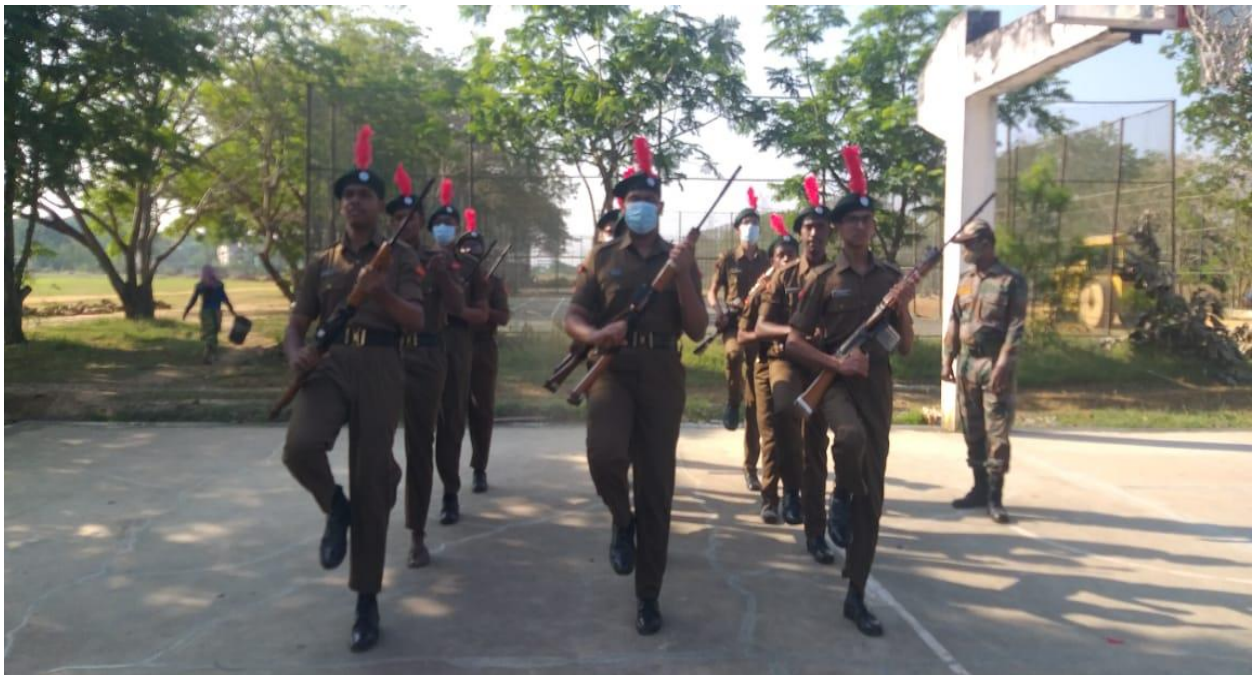
Figure 1. Cadets Practising Weapon Drill

In the morning session, Drill was taught to the cadets. Then PI staffs taught about Types of Fire and its Extinguishing Methods . In the evening session, cadets were tested for Foot Drill and Weapon Drill , Followed by a Written Test . Later cadets participated in the Cultural Program which include Speech, Singing, Silambam and Mimicry .