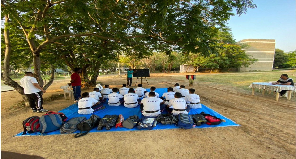
Figure 4. PI staffs teaching Battle Craft and Field Craft