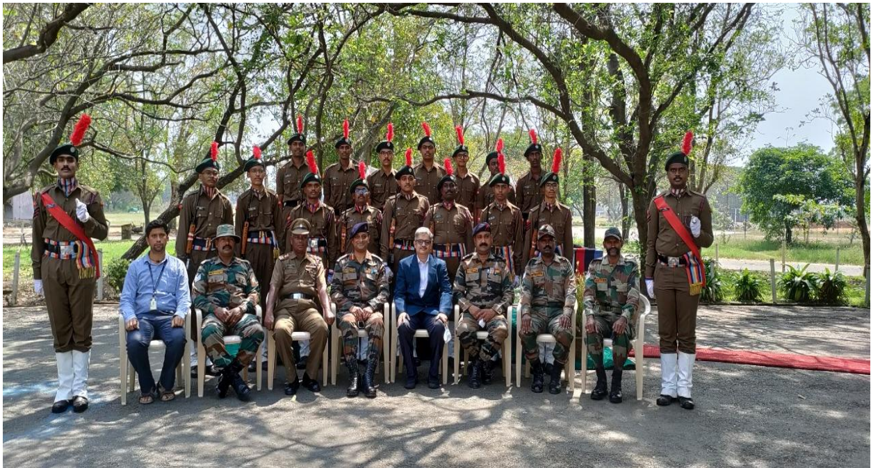
Figure 3. Cadets took the Group Photo