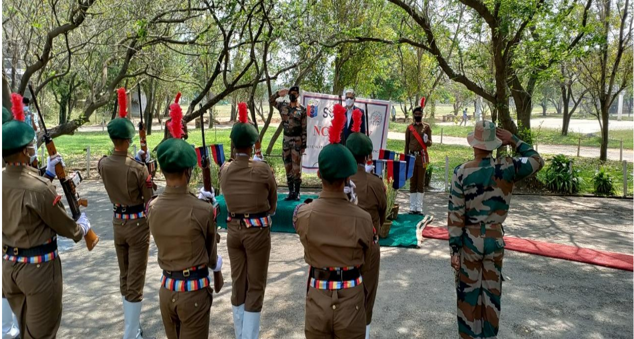
Figure 2. Cadets saluting the CO Col. Jobee Philip, 1 (TN) CTC NCC