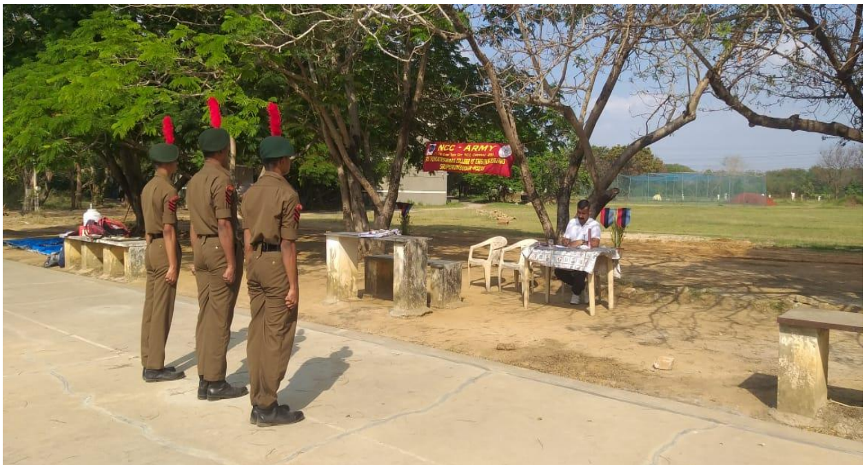
Figure 3. Cadets ready for Drill Test