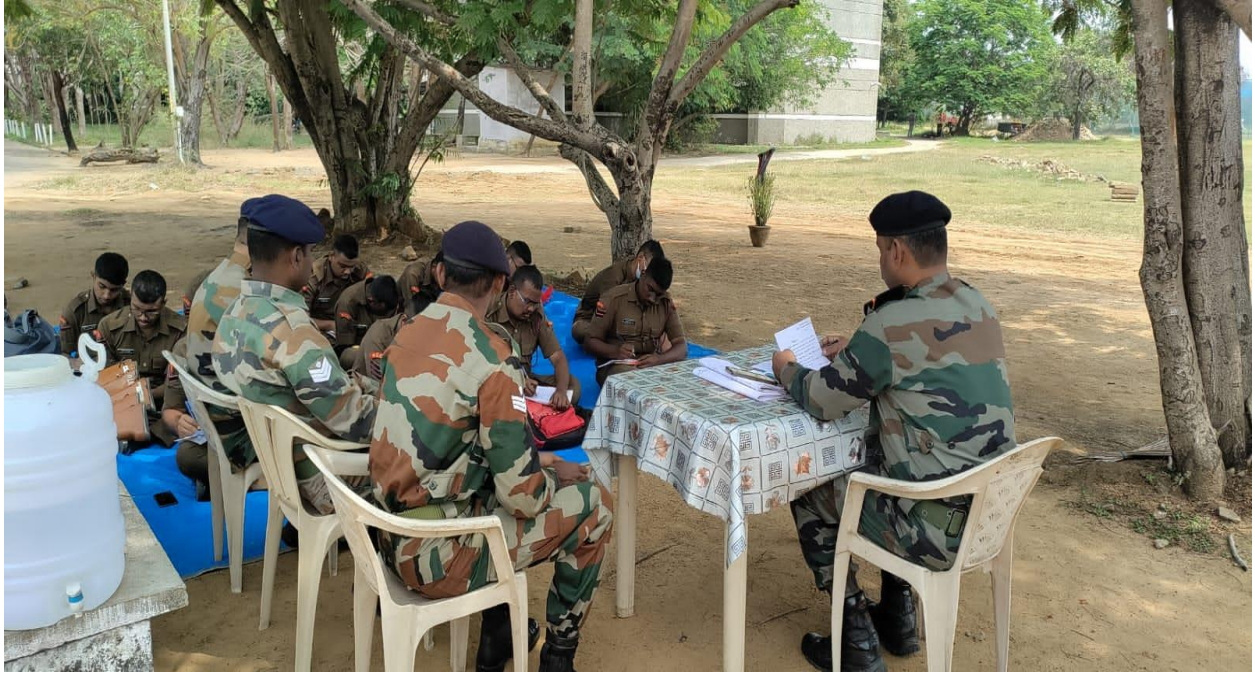
Figure 4. PI staffs announcing test results