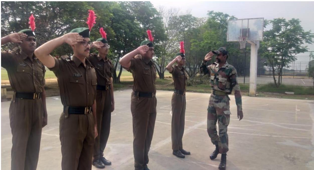
Figure 1. Cadets practising drill

In the morning session, Drill was taught to the cadets. Then Kholna-Jodna and Map Reading test was conducted to the cadets. Later JCO announced the winner and runners of Drill, Written, Kholna-Jodna and Map Reading . Then Feedbacks were collected from the cadets. Later JCO delivered a closing address. The camp concluded with a photo session.