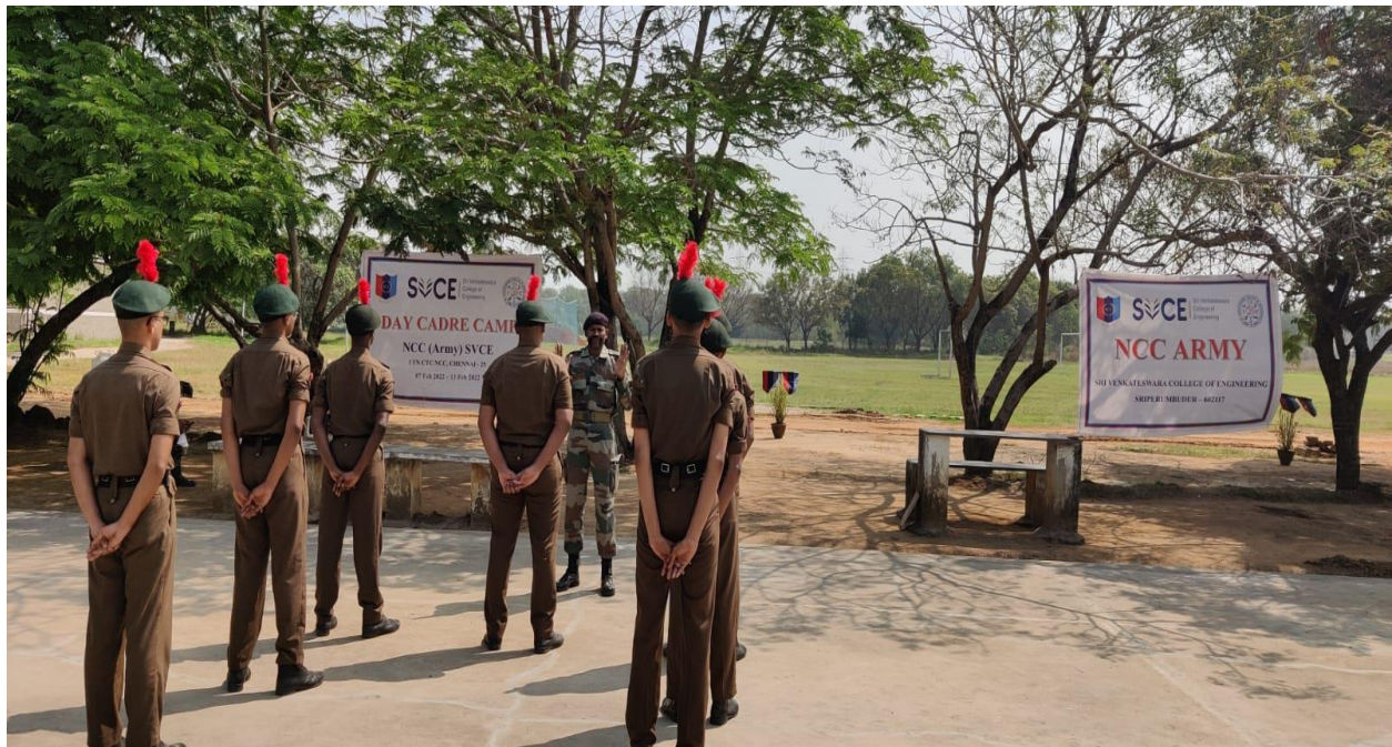
Figure 1. Cadets reporting for the parade